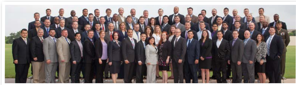
Class of 2016