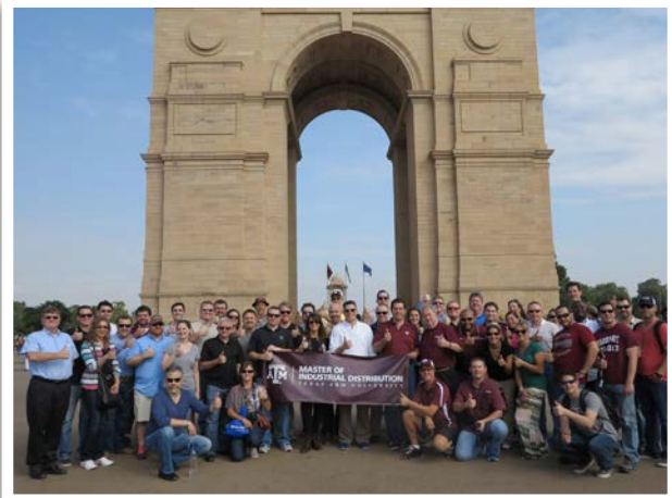
2014 Global Trip - India

★ For Video & More Information Visit: http://mid.tamu.edu ★