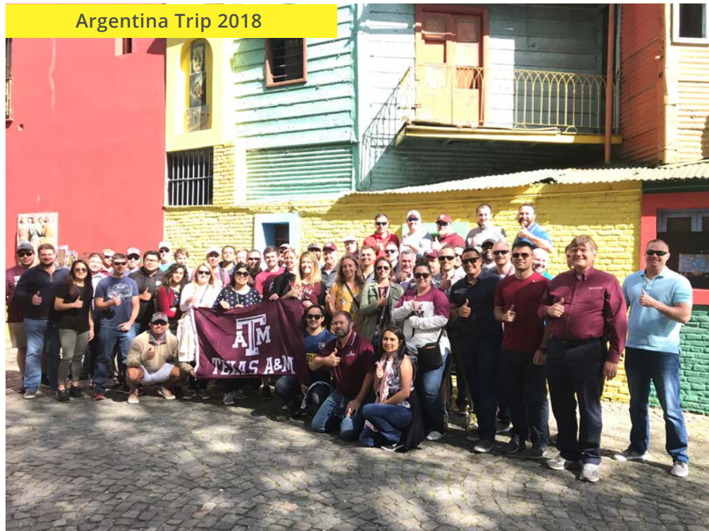
Argentina Trip 2018