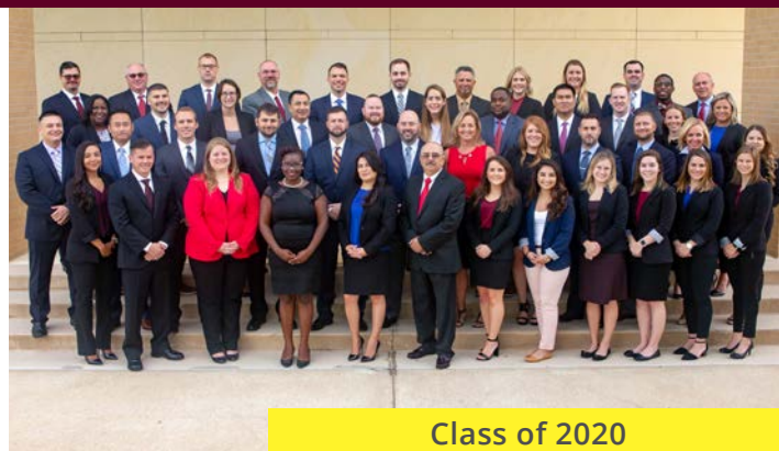
Class of 2020