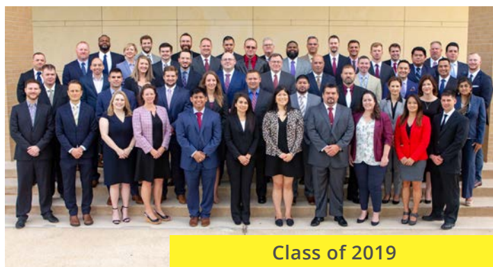
Class of 2019

“The MID program taught me the fundamental tools to position my company how best to go to market, what customers to target, and how to maximize ROI – both as a sales leader and within my career.”